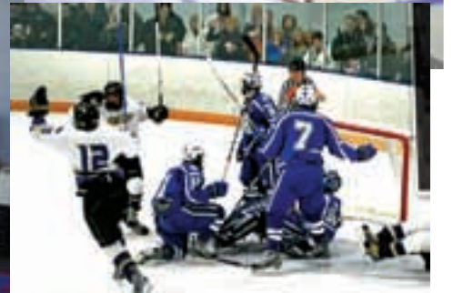
The Arena's second sheet of ice will be the "home ice" for the Chanhassen High School Storm boys' hockey teams.

NOW IS THE TIME FOR FITNESS! See back page for Membership Special Details